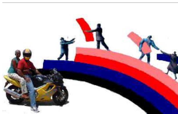
(Working Together For the Common Good!)

Thus, our aim is to continue awakening the mis-educated so-called/self-proclaimed leaders in the community (through our generational analyses stories) to seeing how we have been deceived and brainwashed, in hopes that we can focus and address ourselves to the too-long-neglected work—that is, community teamwork.